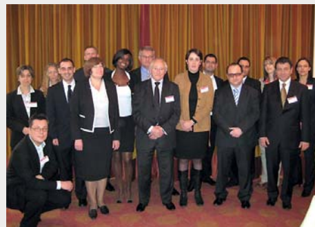
Above: Photo from the first TRA meeting

After the first meeting in Paris in 2013, the second meeting in Regensburg in 2014 will be the base for developing the cooperation between the member firms and for upgrading the structures.